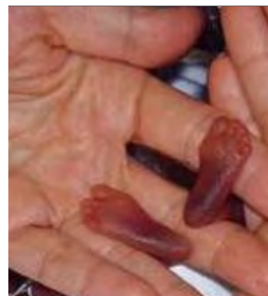
A small survivor with the Holy Spirit

There is holiness in the very thought of this; and the idea of sin as something that will drive out this Divine Tenant acquires a clearer and more repulsive meaning.